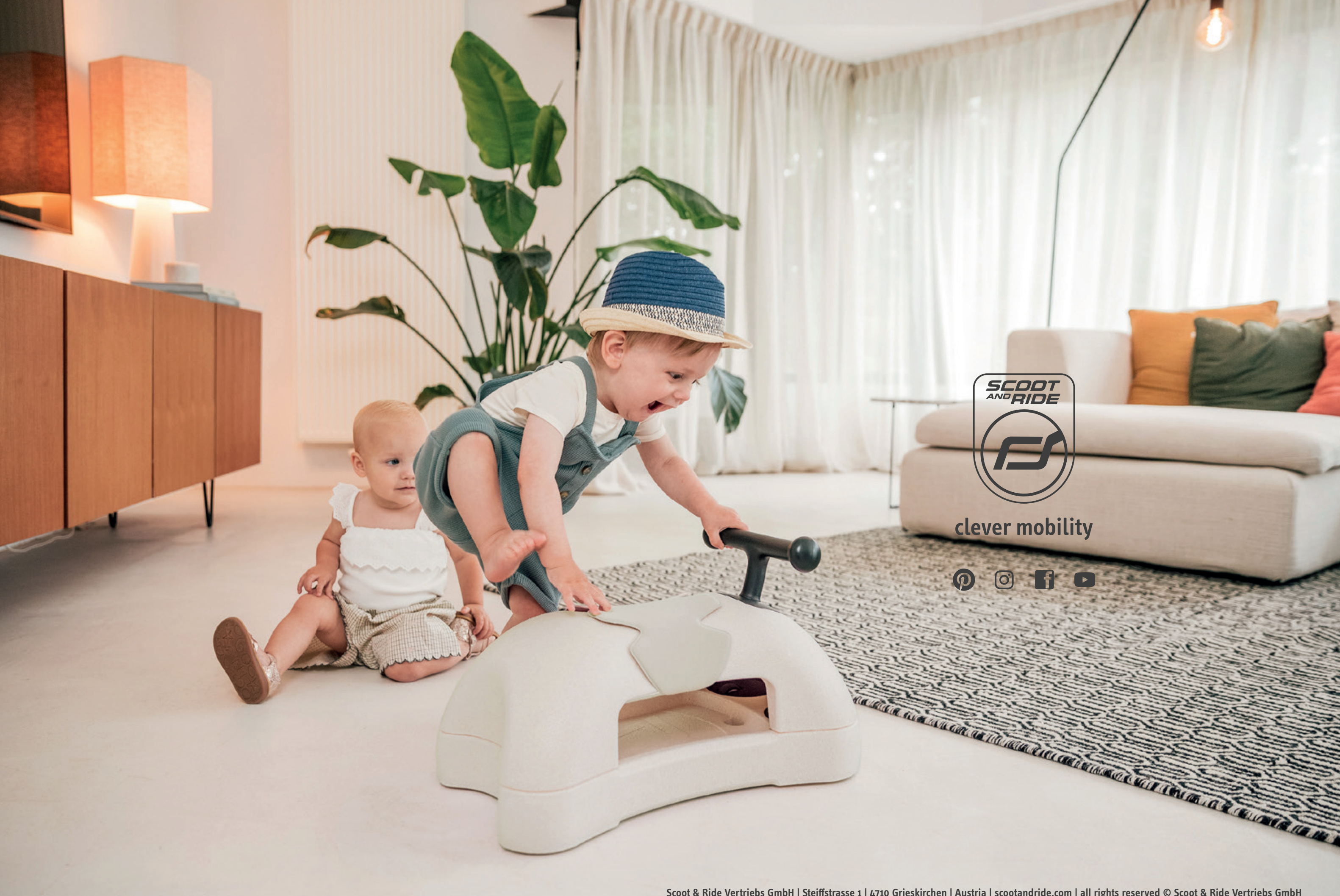
Scoot & Ride Vertriebs GmbH | Steiffstrasse 1 | 4710 Grieskirchen | Austria | scootandride.com | all rights reserved © Scoot & Ride Vertriebs GmbH Products shown may not be available in all regions, please check with your local Scoot & Ride retailer for availability.