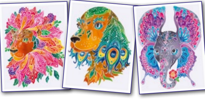
Chimeras Ref: 6398