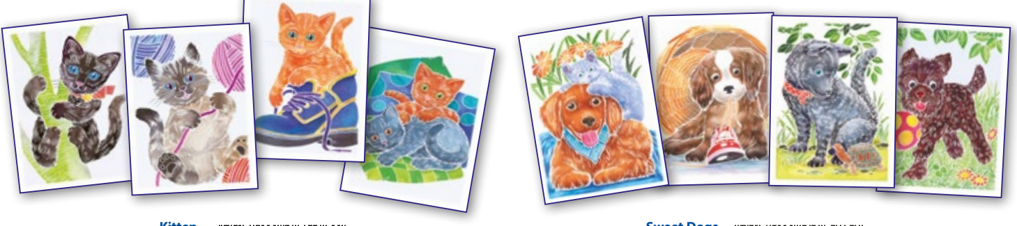
Kitten Ref: 6506