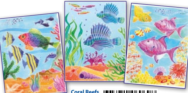
Coral Reefs Ref: 6060