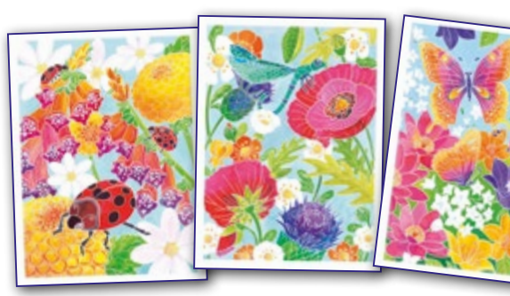
In the Flowers Ref: 6391