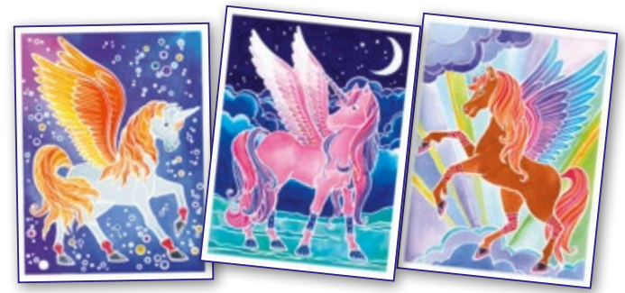
Pegasus Ref: 6320