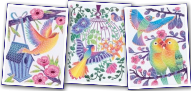
Flying Birds Ref: 6395