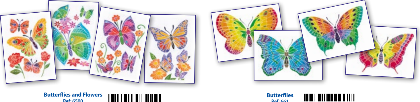
Butterflies Ref: 661