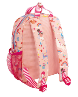
51P6234 RAINBOW FAIRY BACKPACK