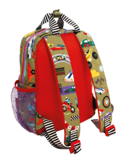
51P6233 CARS BACKPACK