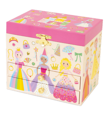
51P6211 PRINCESS JEWELLERY BOX